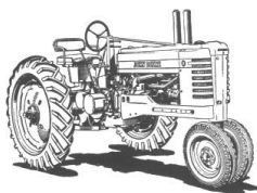
Late styled JD B